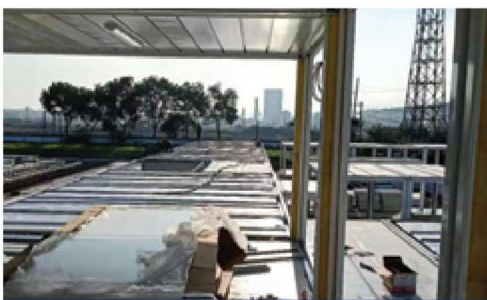
Fast delivery and installation