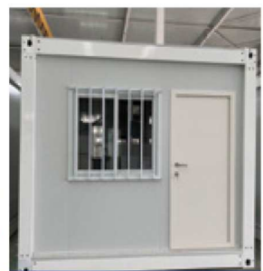
Robust and durable