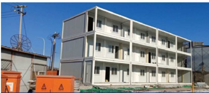
Flexible and scalable