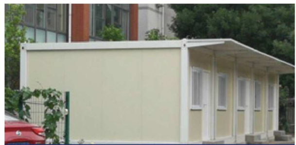
Quality modular units