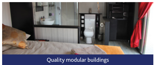
Quality modular buildings