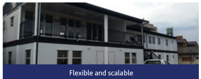
Flexible and scalable